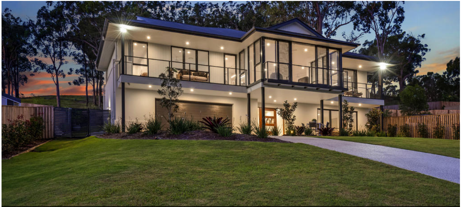
4 Bobsled Lane, Coomera